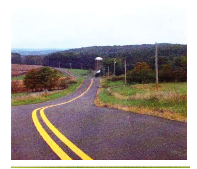
Welcome to Ohio's