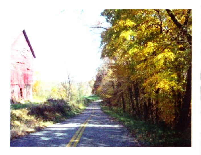
This safety message brought to you by Holmes County Safe Communities